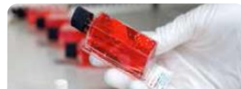
Stem Cell Generation

Clinical- and GMP-Grade products are available!