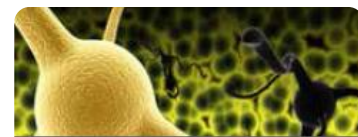
Stem Cell Characterization