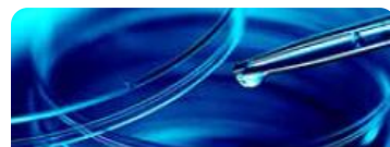
Stem Cell Culture